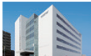
Research & Development Center