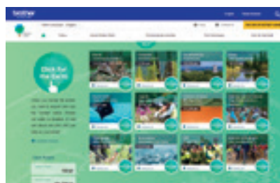
Click for the Earth