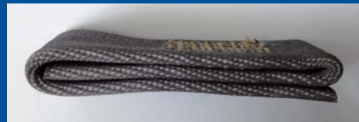
six-ply sewing for seatbelt

The use of the advanced controlled, heavy duty feed mechanism provides excellent, superb stitch quality and tight stitching even for extra-heavy sewing applications. Also, the upper thread feeding device which supplies the necessary length of upper thread at the start of sewing, preventing the thread from pulling-out regardless of the material feeding amount.